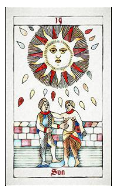
Tarot of Marseilles, What hand colored blockprints might have looked like.