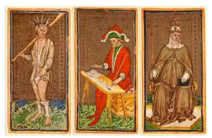
15<sup>th</sup> century handpainted Visconte Sforza Trumps