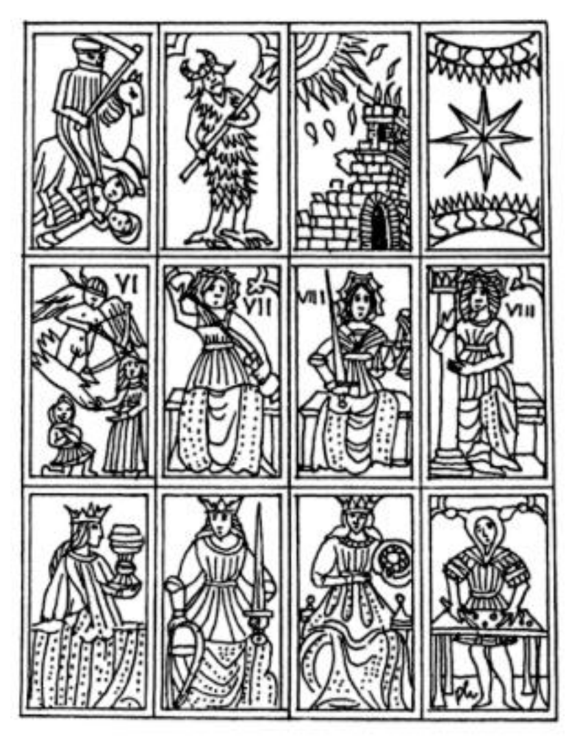
15<sup>th</sup> Century Italian woodblock printed sheet of Tarot Trumps and Court Cards Image from Huson's book (see Suggested Readings above).

Douglass A. White. The Senet Tarot of Ancient Egypt, Part I: A History from Pre-Dynastic Times to the Roman Era. Available from <a href="http://www.bentylightgarden.com/StoreMenuE.htm">http://www.bentylightgarden.com/StoreMenuE.htm</a> to read or as a free download.