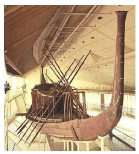
A Great Pyramid Solar Boat