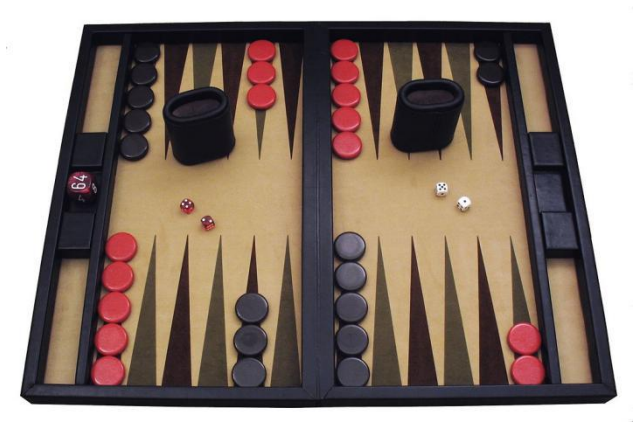
Modern Backgammon Board

If the game survived as Backgammon, we should take a look at a modern Backgammon board.