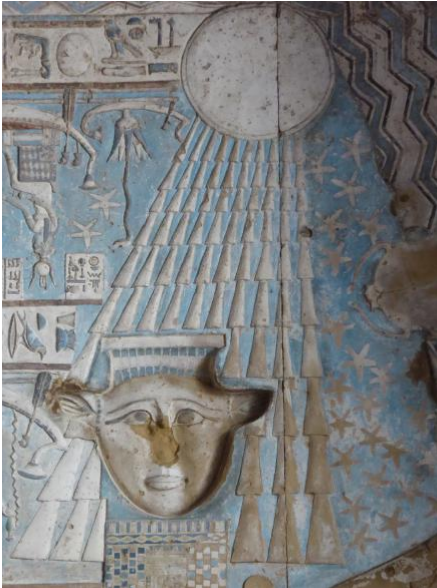
The sun emerges from the womb of Newet, and Hathor's face appears in the light rays.