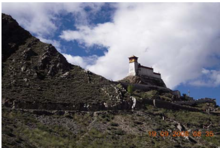
The castle in the distance. Earliest Castle in Tibet.