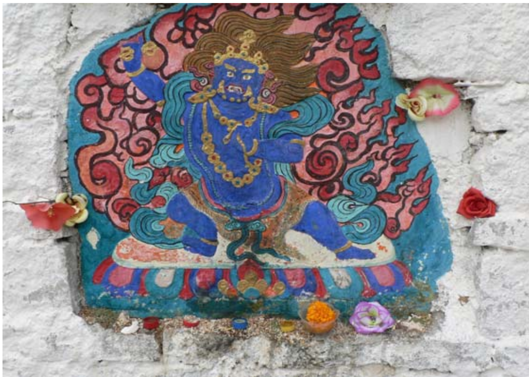
Graffiti on the walls outside Potala. No pictures allowed inside :-( The graffiti are as good as what's inside, the lighting is better, and the common people have free access.