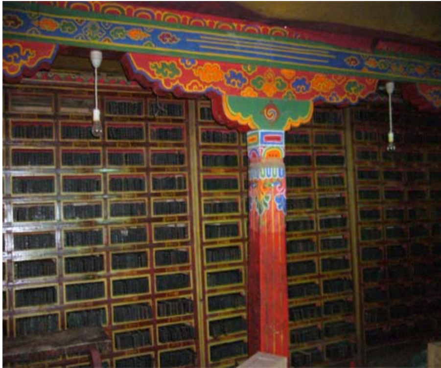
Library of wood blocks for printing sutras. During the Cultural Revolution 100's of thousands of these wood blocks were burned and now have to all be re-carved by hand