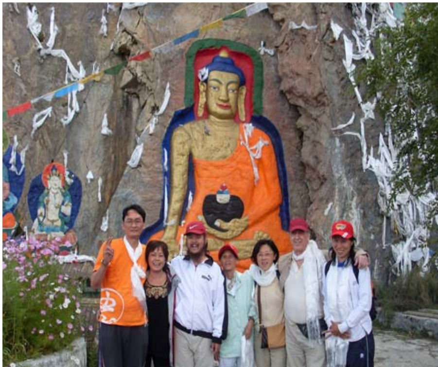
We stop at an early rock carving on our way into Lhasa.