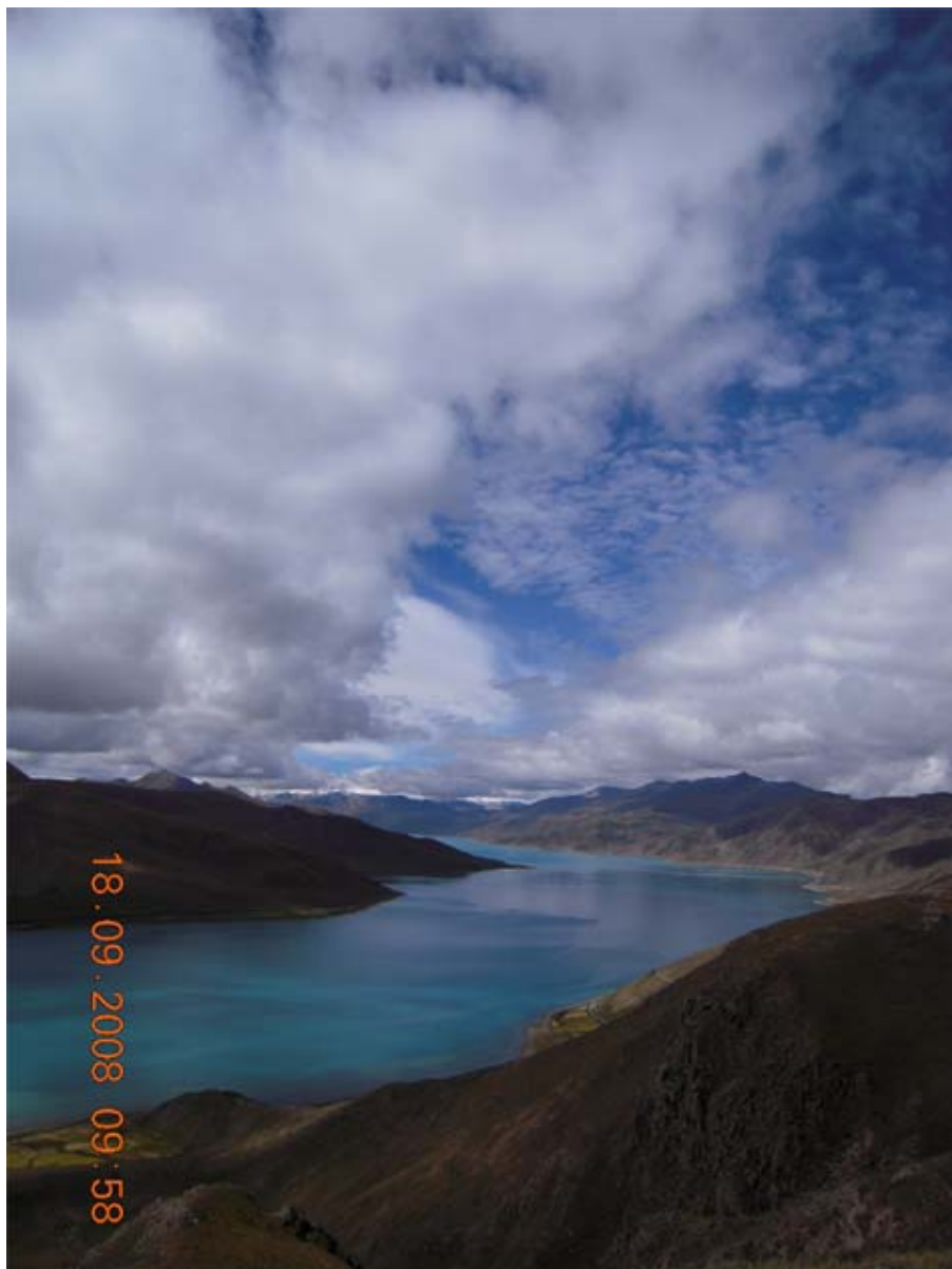
Yang-zho-yung-co Sacred Alpine Lake