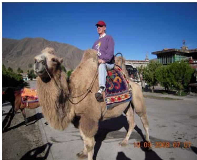
Riding a camel to an ancient Yung-bu-la-kang Castle of 1 st Tibetan King