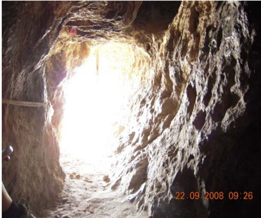
View from inside a cliff cave