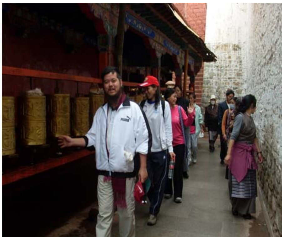
We circumambulate the Potala