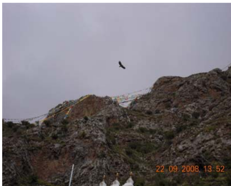
Vulture at a Heavenly burial on top of cliff caves. Note 3 white stupas.