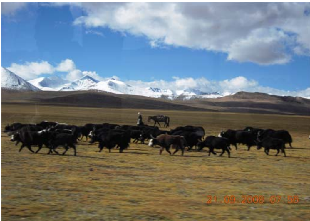
Herd of yaks led by cowgirl on high alpine plain