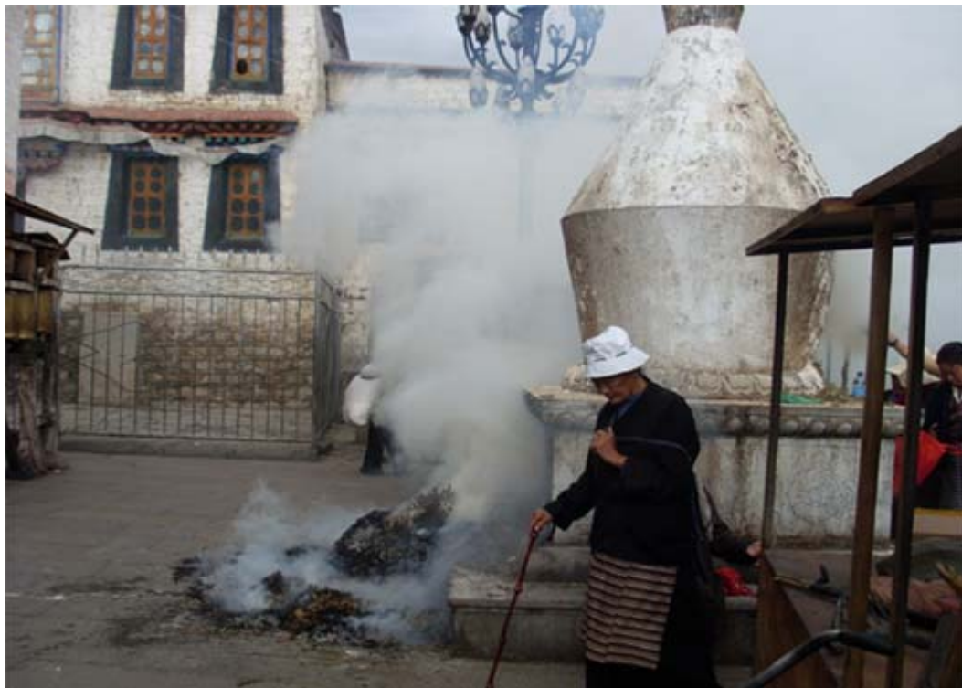
Burning incense outside Jhokang