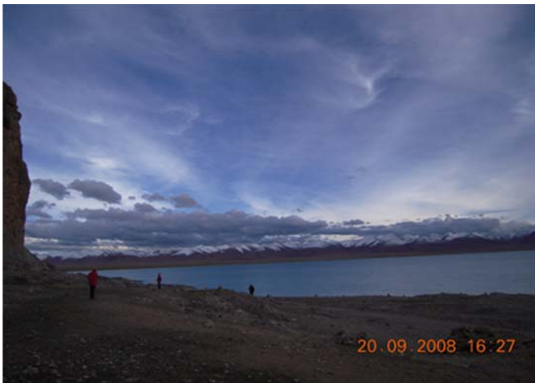
High Alpine Sacred Lake, 4700+ meters altitude Not much oxygen to go around.