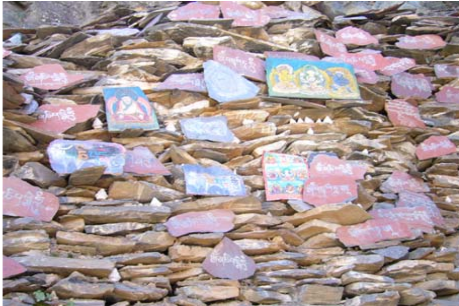
Piles of incised and painted prayer slates