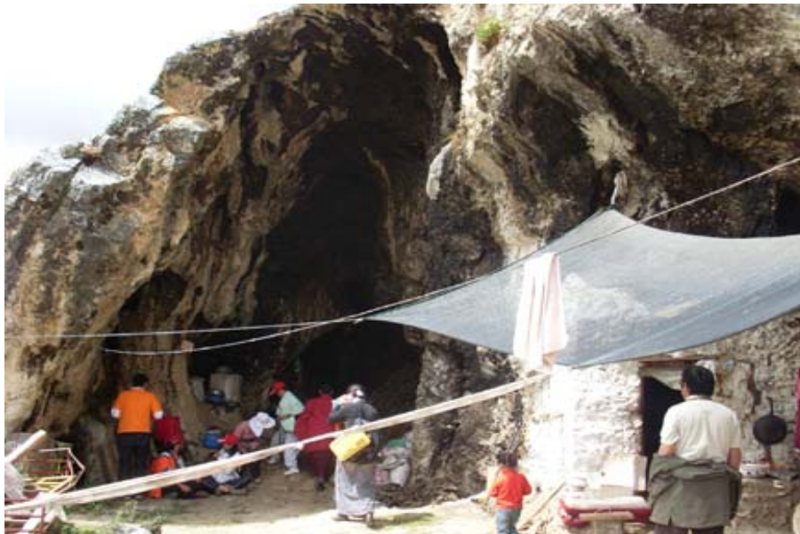
Lunch break at the Cliff Cafeteria