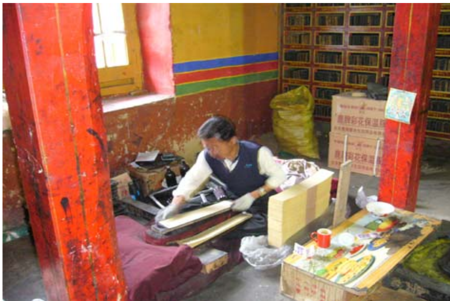
A print shop at Sela Temple. Printing sutras.