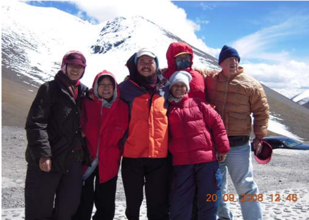
Getting High on an Alpine Pass