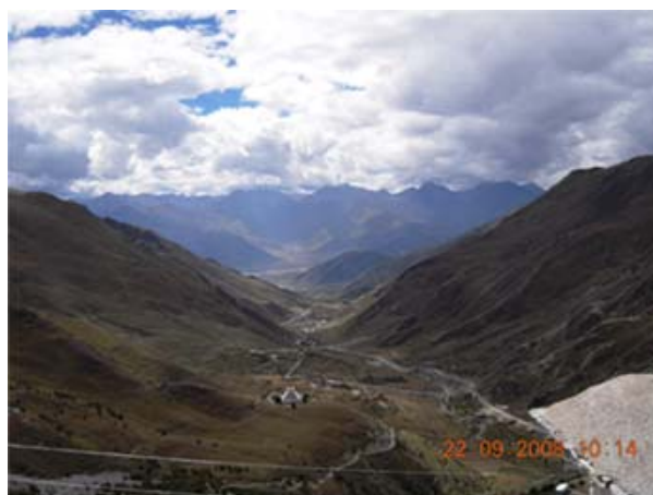
View from the cliff caves (Note white stupa in lower center)