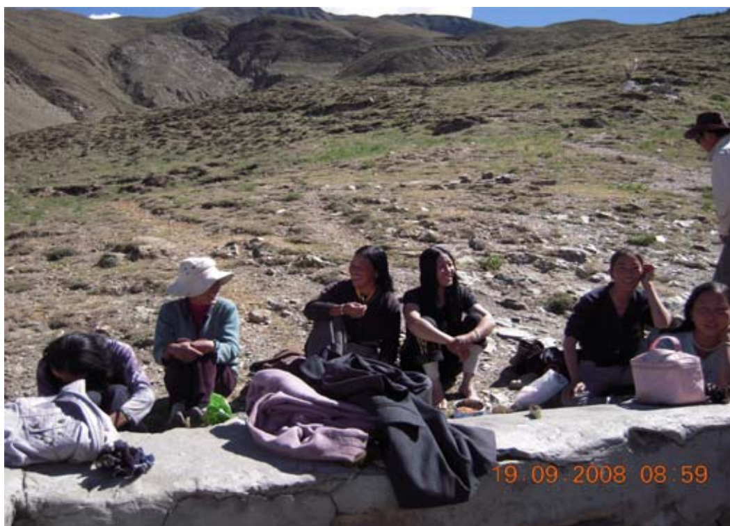
A troupe of Tibetan singing ladies relaxes by a spring