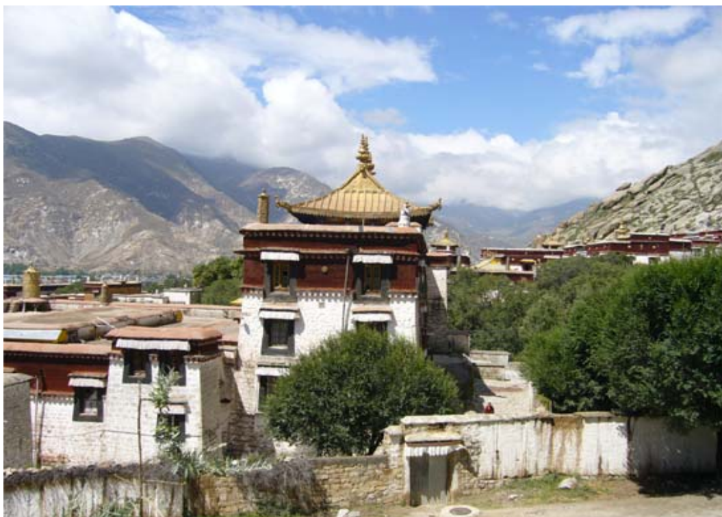
View of a section of vast Sela Temple