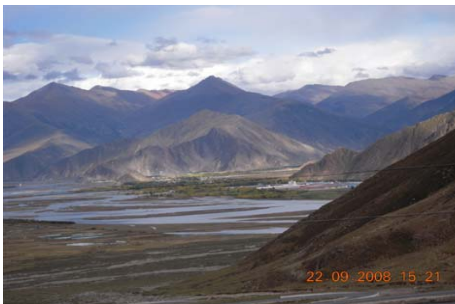
View from the Kashyapa cliff caves