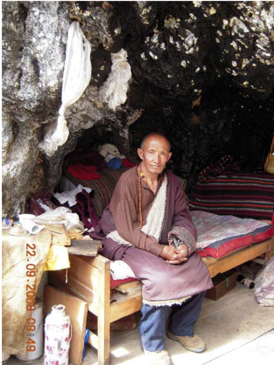
A monk in his cliff cave