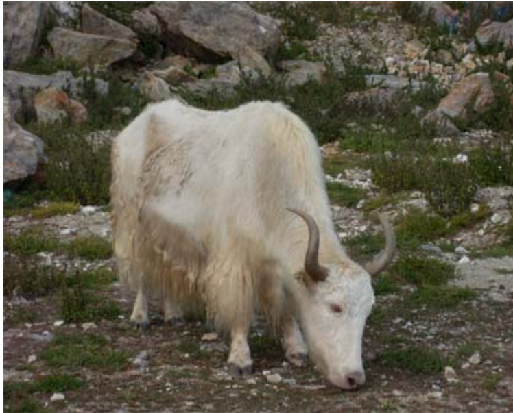
A gorgeous white yak