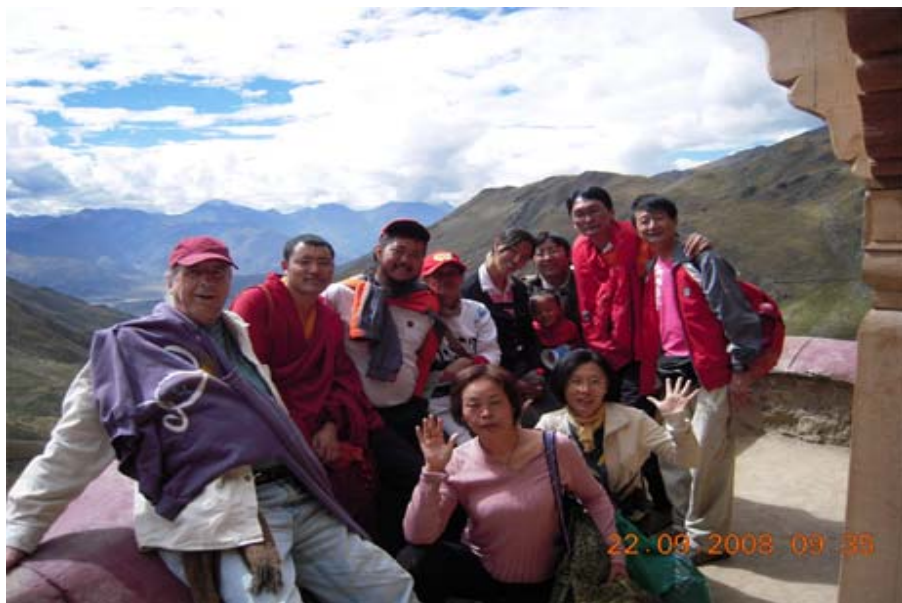
Group photo on a ledge along the cliff caves