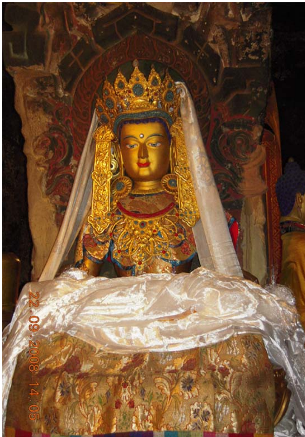
Jewel encrusted votive art