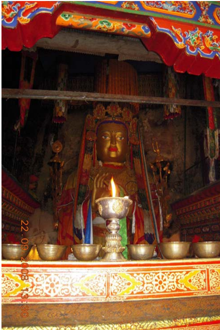
Maitreya in a cliff temple