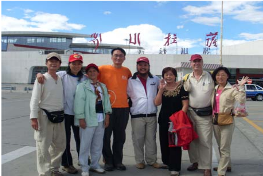
We arrive at Lhasa airport.