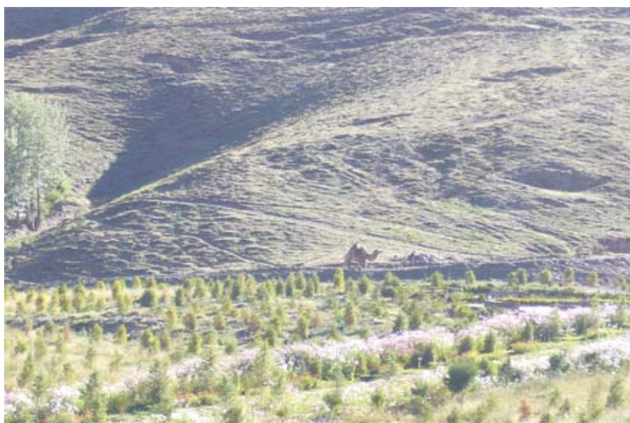
Camel en route