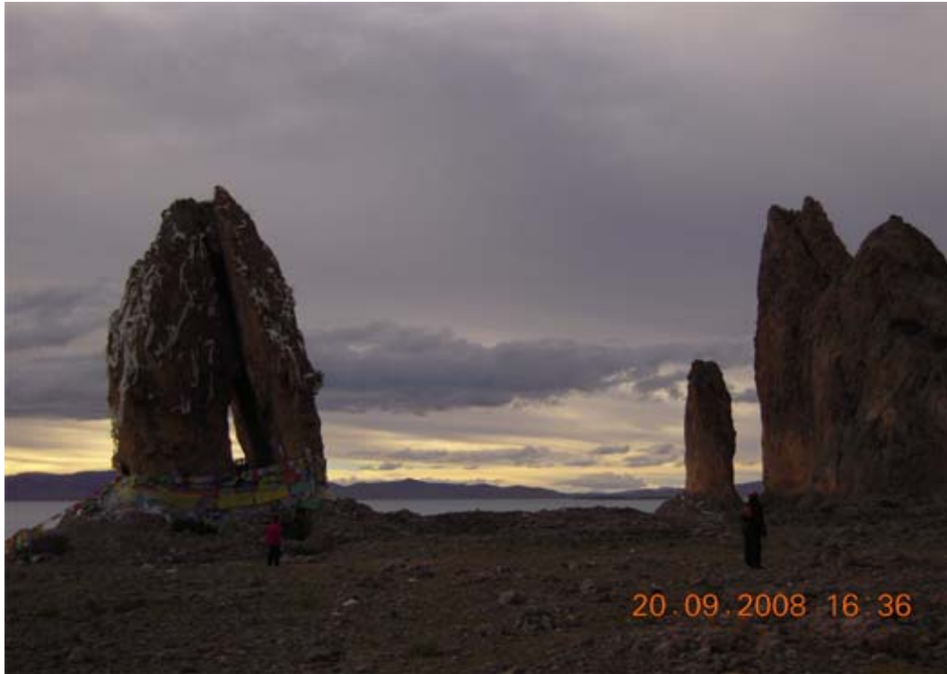
Buddha's namaste at sunset – overlooking alpine lake at over 4000 m.