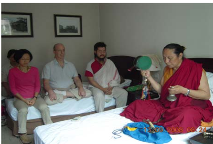
Hutukhtu blesses us for our Spiritual Trip to Tibet.