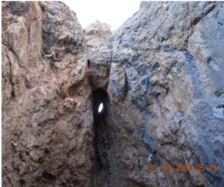
A Peephole at Heaven