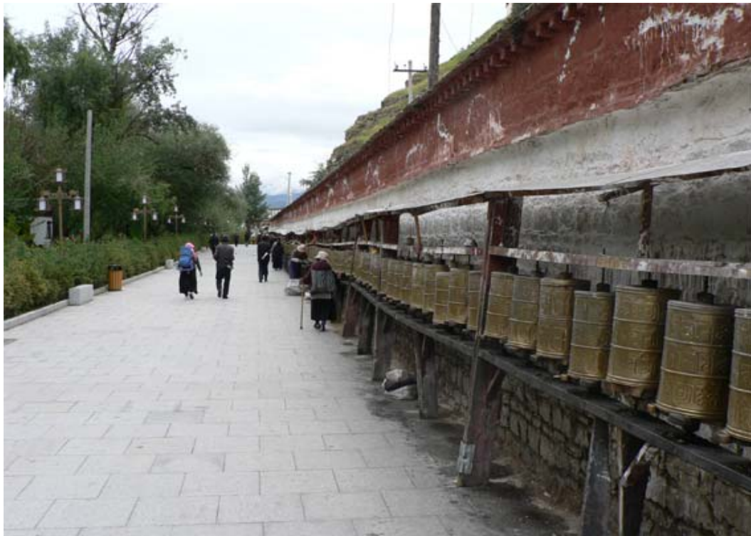
Countless prayer wheels along the circumambulation route