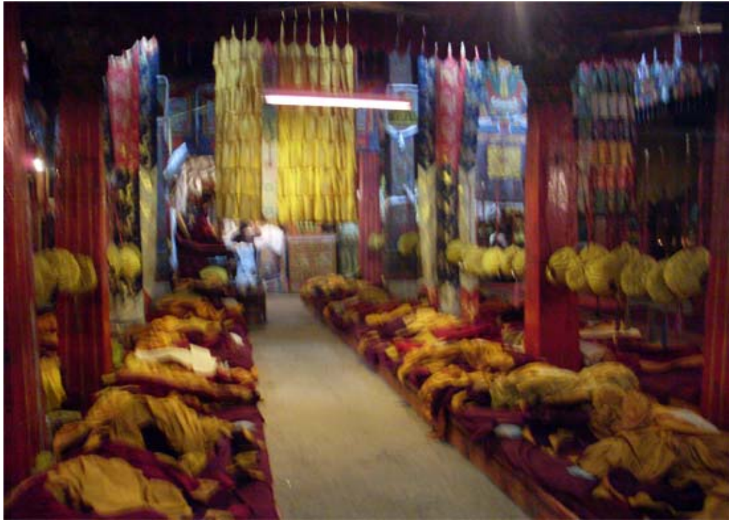
Quick shot inside a temple hall as monks prepare to begin service.