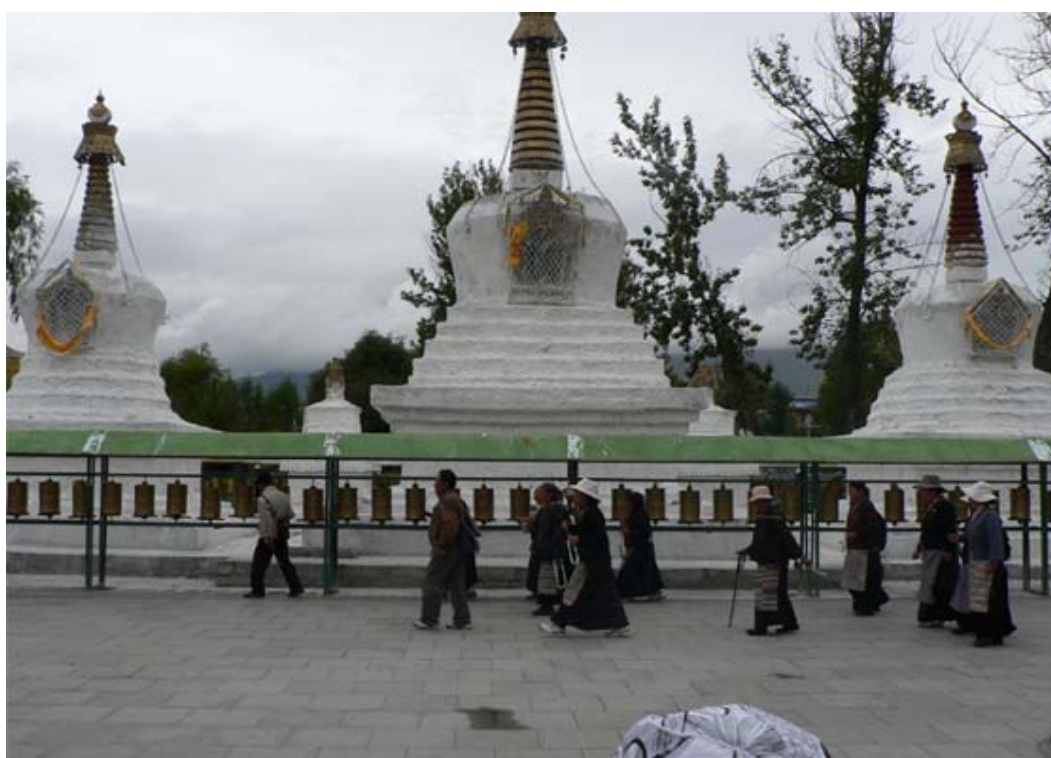
Stupas along the circumambulation route