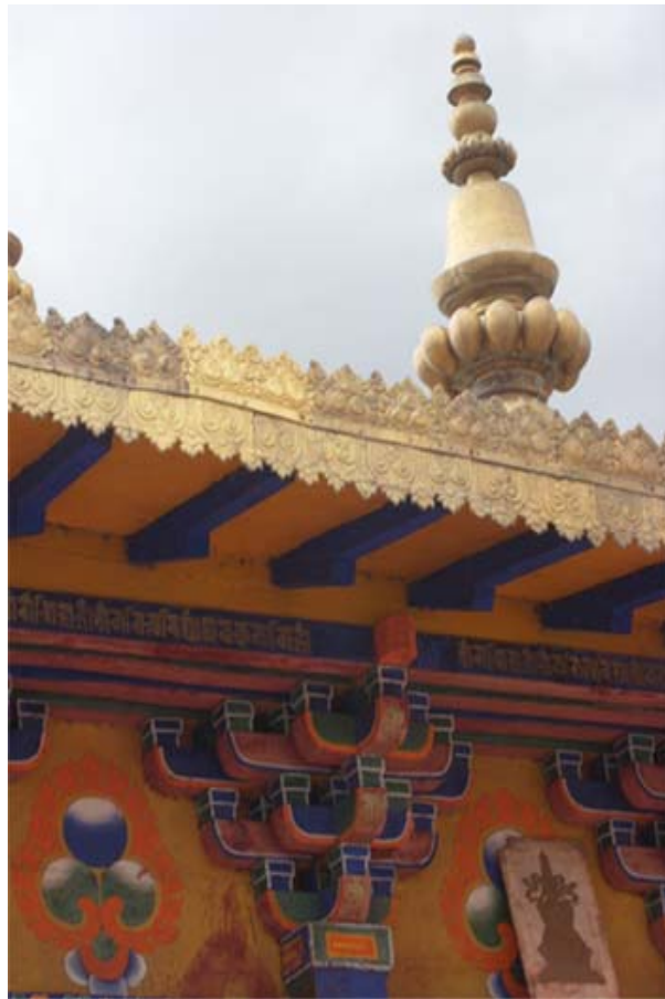
Going right out the roof.