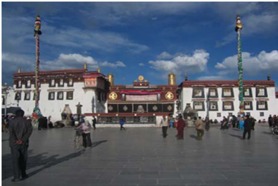
A closer view of Jhokang Temple