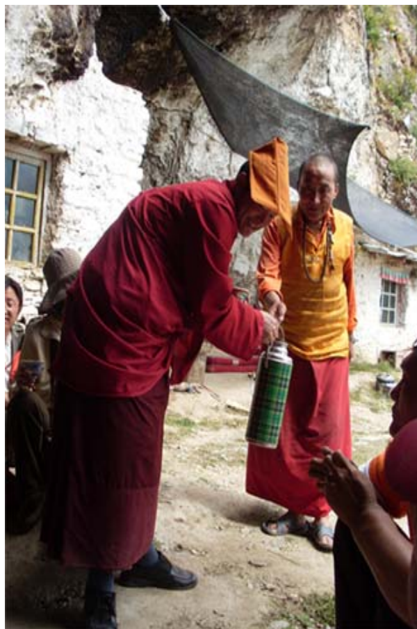
More tea for everybody