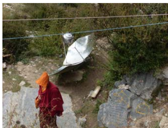
Tibetan Solar Power