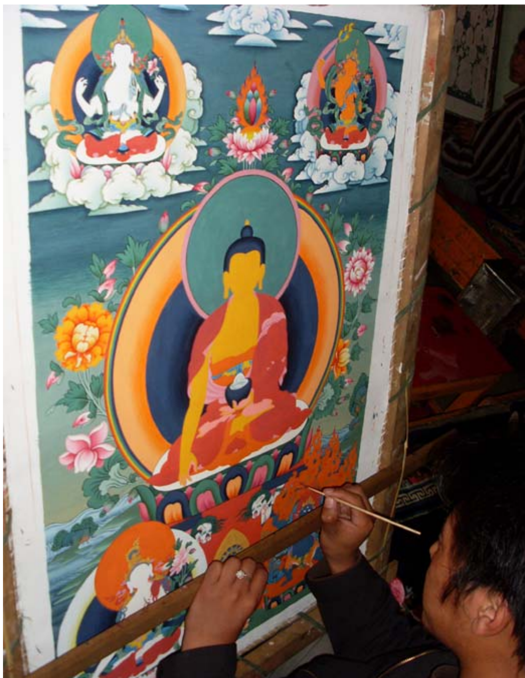
Painting a Tanka, a Tibetan Spiritual Exercise