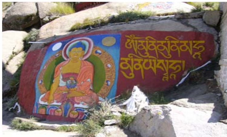
Graffiti at Sela Temple (No pictures allowed inside)