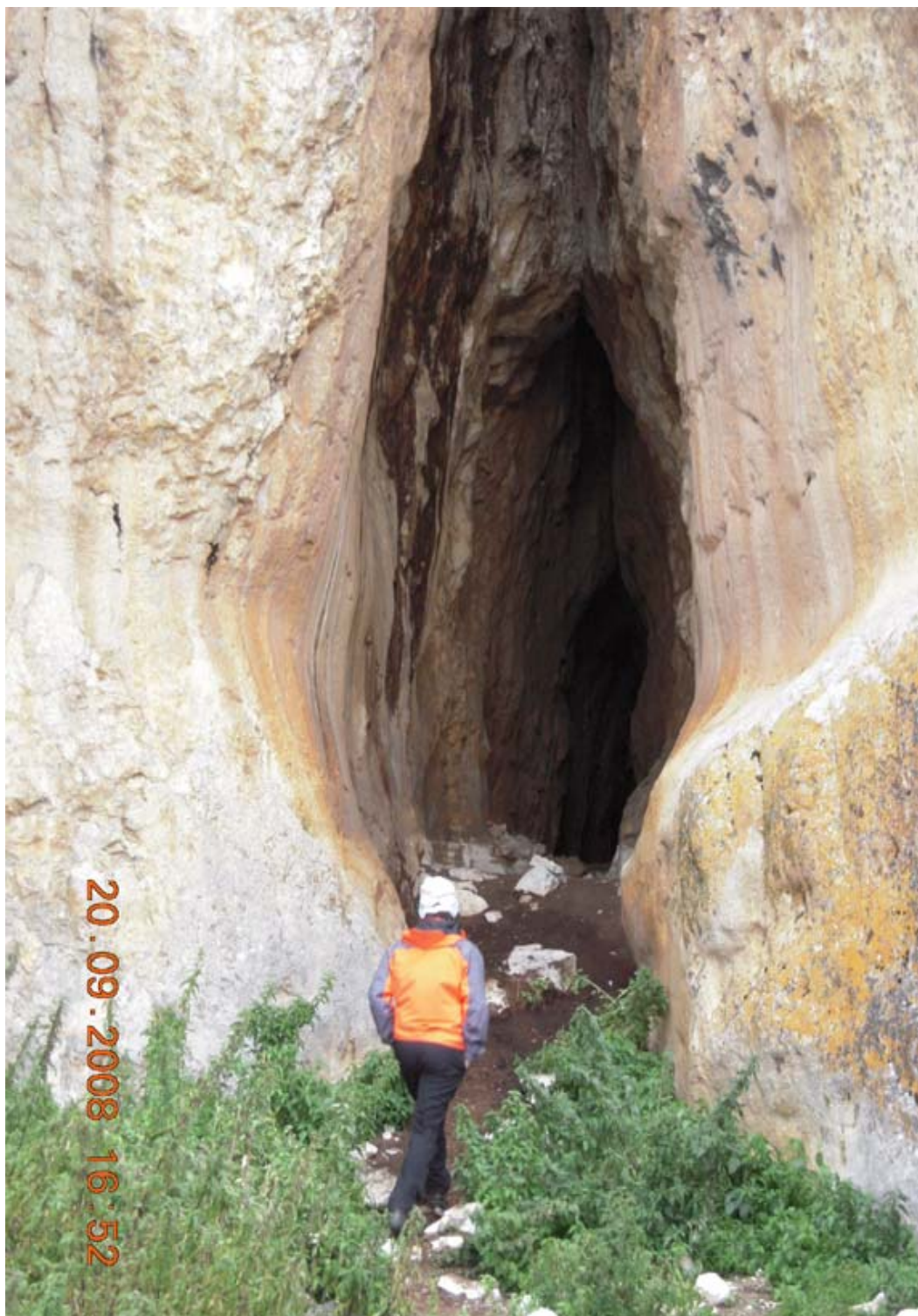
Entrance to a Meditation Cave