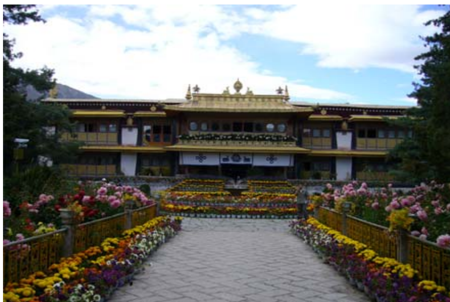
Norbulingka Summer Palace of Dalai Lama in Lhasa