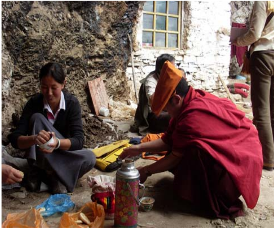
And the monk pours yak butter tea