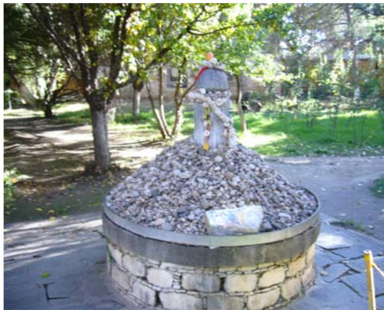
Sacred Lingam outside one of the Summer Palace Temples