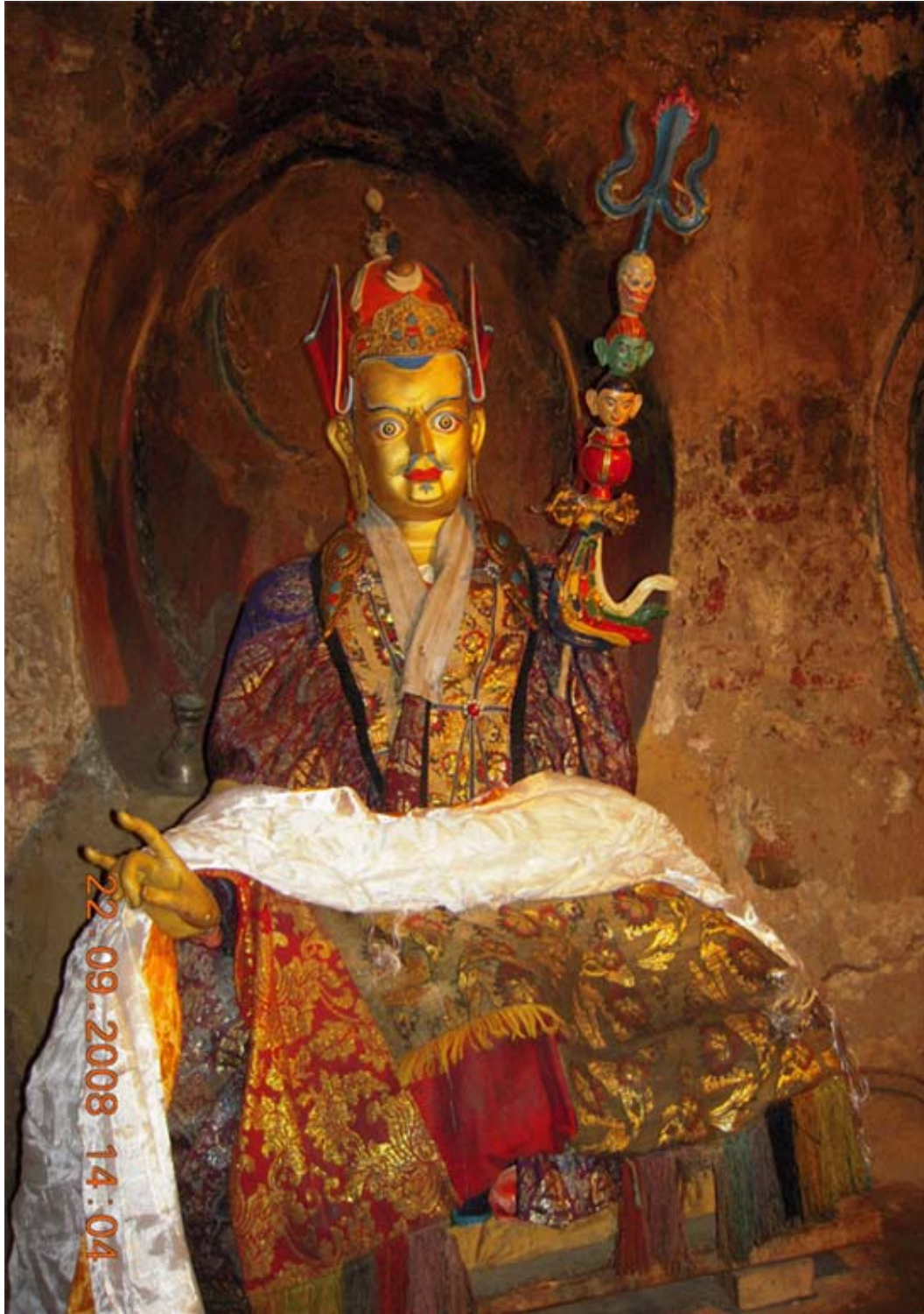
Fierce Padmasambhava in a cave