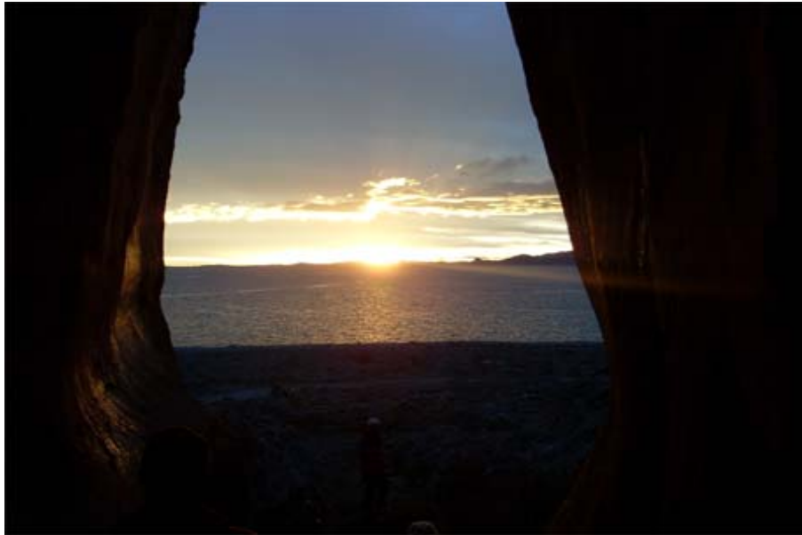
Sunset over the lake from entrance of a large cave