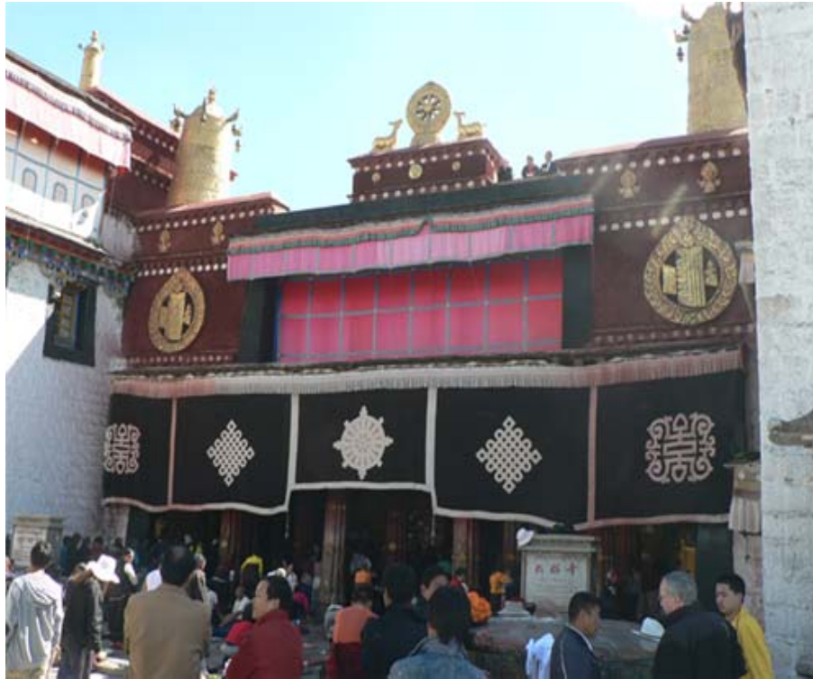
Entrance to Jhokang thronged with holiday visitors Note people prostrating on the porch