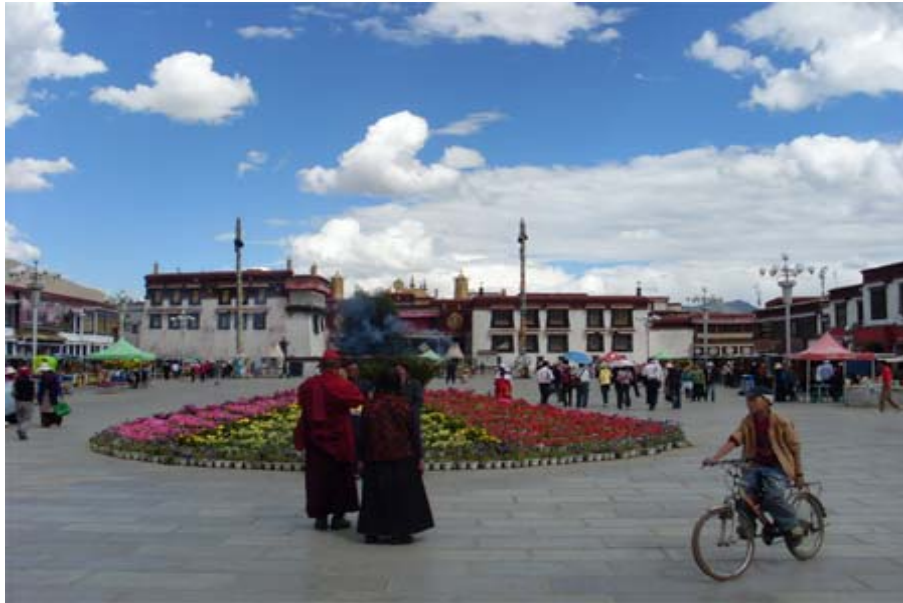
First stop: Jhokang Temple, Lhasa