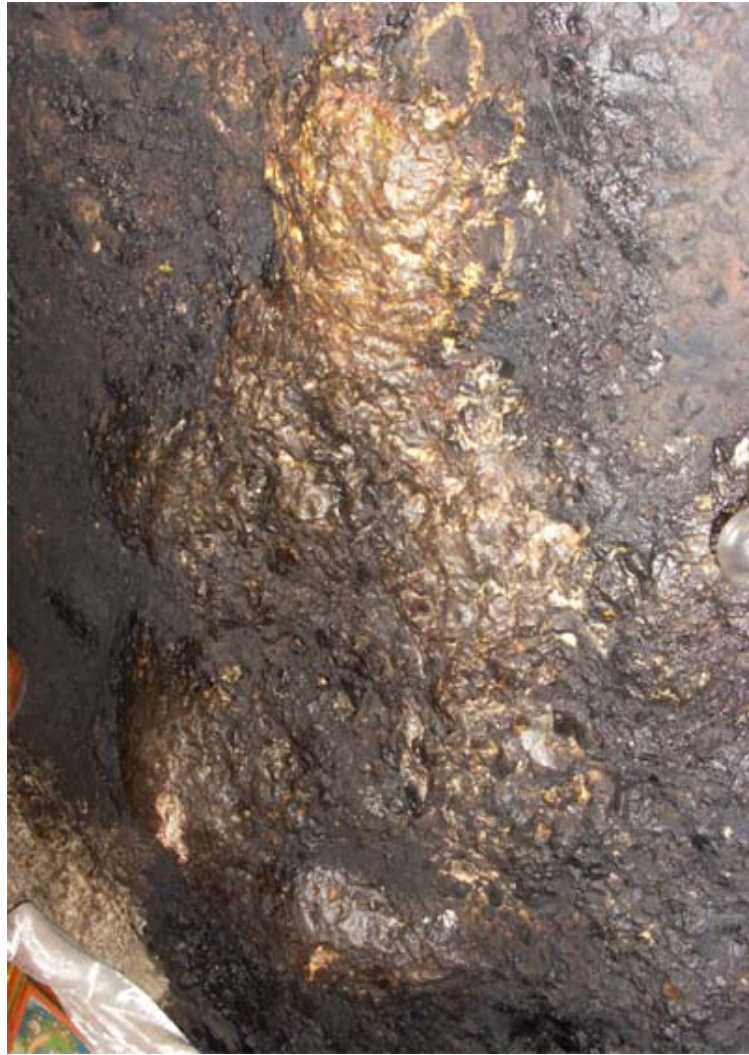
Golden glow left in rock by Padmasambhava in a cave