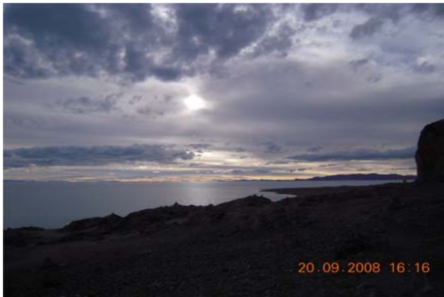
View from one of the caves